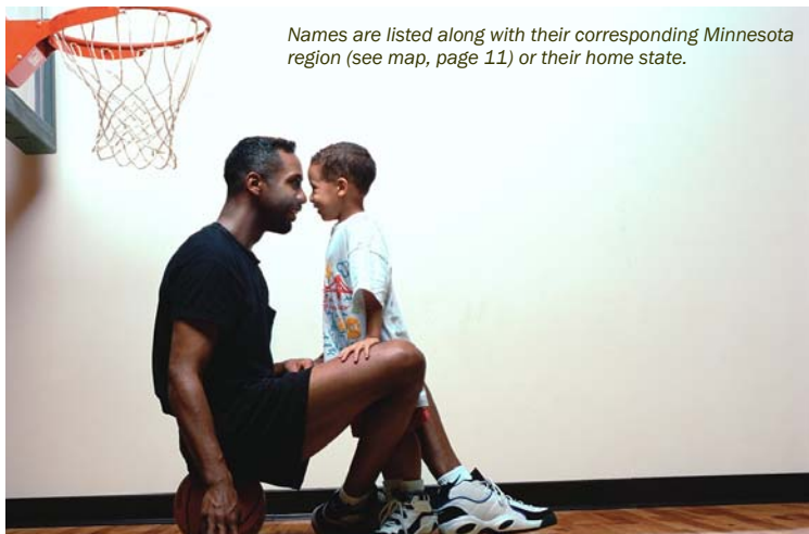
Names are listed along with their corresponding Minnesota region (see map, page 11) or their home state.