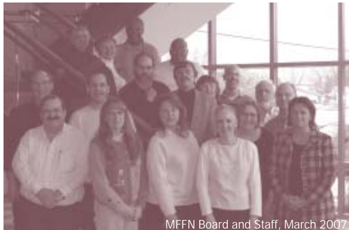
MFFN Board and Staff, March 2007